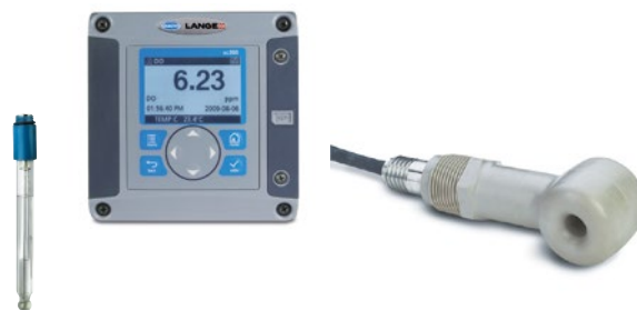
Controllers and sensors for online analysis