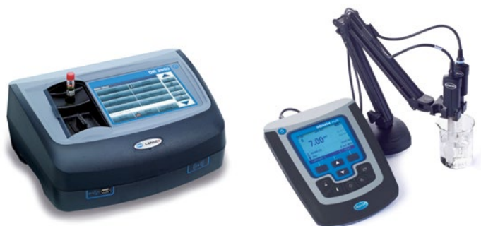
Benchtop and portable instruments for lab analysis, with special tests for plating baths. Inspection, maintenance and equipment qualification services available

* For additional parameters and solutions please contact your local Hach representative or visit our website.